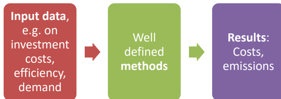
Figure 1. Transparency requires that all input data is published and can be reviewed, and that methods are documented and are easy to understand. If this is fulfilled, results can be fully understood.

With a transparent set-up the discussion can change from “for or against” a certain technology to a discussion about the assumptions. If parties can agree on the assumptions (including input data) and understand the methods, then consensus about the results is realistic.